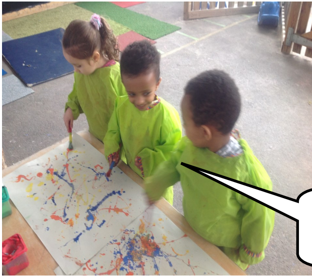
Nehemia "Happy Diwali"